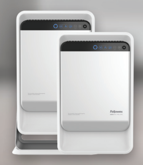
AeraMax AM 2 Series purifies 150-250 Square Feet

Air Purification Solutions (Planning and Budget) Provided by Indoff - Silicon Valley & North Denver Urban Branches