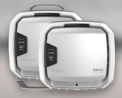
AeraMax AM 3 Series purifies 300-550 Square Feet