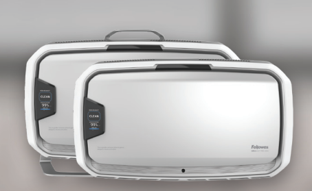
AeraMax AM 4 Series purifies 650-1,100 Square Feet